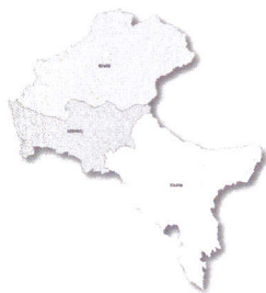
Position of Northern Primorska (Goriška) development region in Slovenia

The ageing trend of the population in the last ten years shows that in 2050 more than 30 % of the population in the region will be aged 65+, while in the Soča Valley this number will grow up to 40 %.