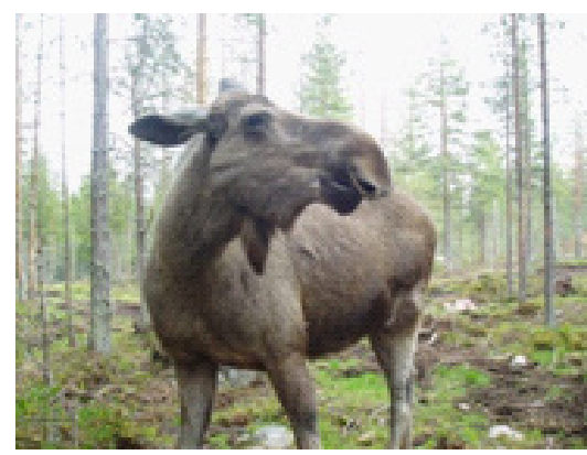
The Moose Adventure Park, Fulufjället