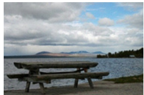
The Lake Femunden, the largest mountain lake in Norway